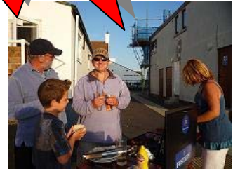
Friday 25 th June – New Members Welcome Night BBQ

CONTENDER NATIONALS - SATURDAY 19 TH – 22 ND SEPTEMBER