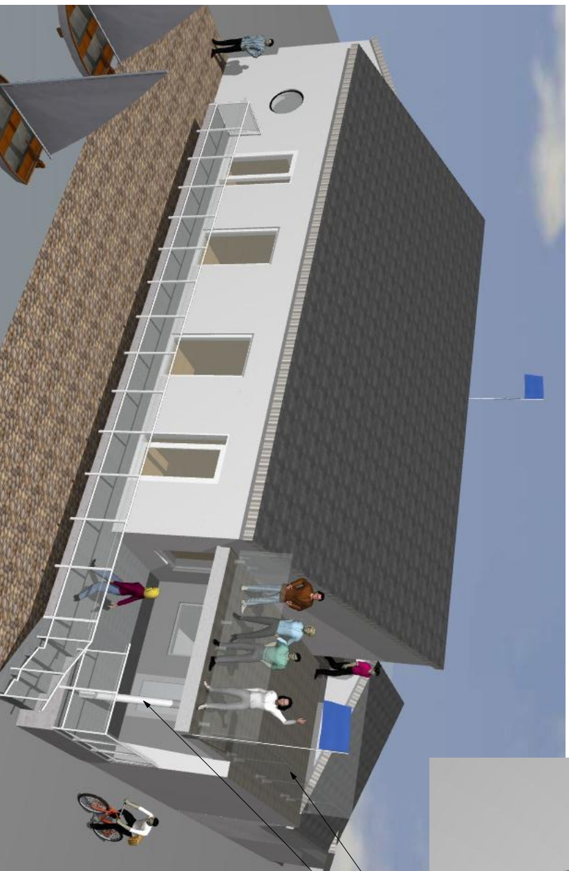
North West view

Glass balustrade Terrace extended. Support post (cantilever structure without post optional).